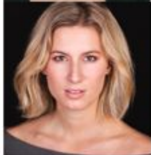
Producer and Actor